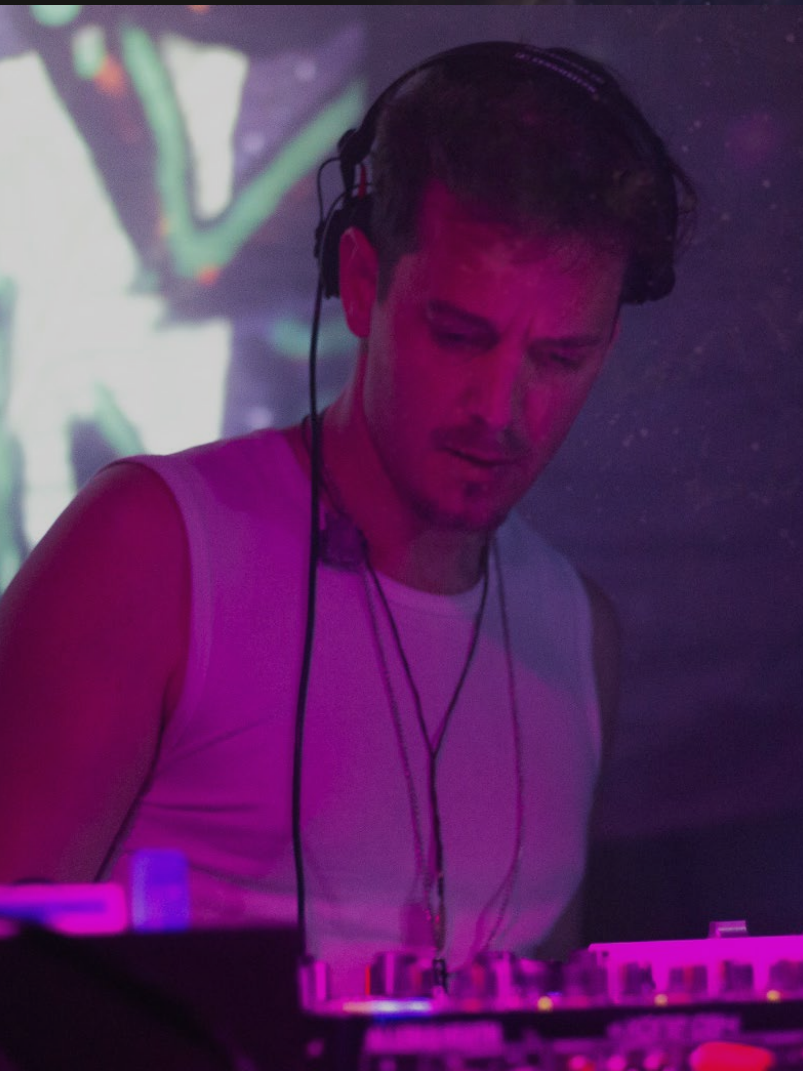
Feszek, Ungarn 2018