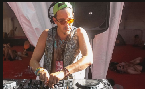
Sziget Festival, Hungary 2019

2014–until today: White Rabbit (DE) | Wörli (DE) | Hans-Bunte-Areal (DE) | KTS (FR) | Jos-Fritz-Café (FR) | SchmitzKatze (DE) | Ruefetto Club (DE) | Playboy Bar (DE) | Crash (DE) | Klunkerkranich (DE) | Lärm (HU) | Trackers (BR) | Valyo Kikötő (HU) | SommerResidenz (CH) | Landestelle (CH) | Kabin (HU) | Gátórház (HU) | Mini-Bar (HU) | Kagylo (HU) | IL Panorama (HU) | Szabadkikötő (HU)