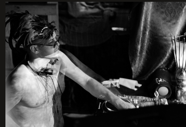
Taka Tuka Festival, Hungary 2019