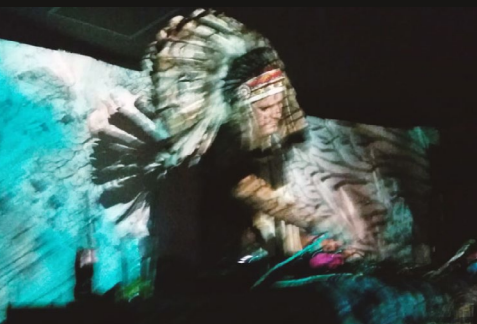
Trackers, Brazil 2018