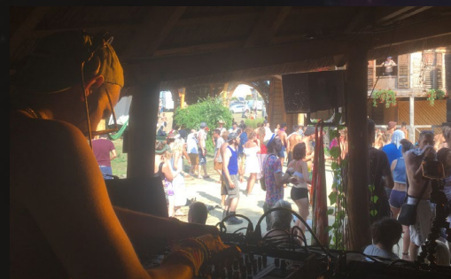
O.Z.O.R.A. Festival, Hungary 2019

TAKA TUKA (HU) | O.Z.O.R.A (HU) | SZIGET Festival (HU) | Gátórház Gathering (HU) | Sugo Strand (HU) | 10 Jahre im Wunderland (FR) | Hinter den Spiegeln (DE) | LSD 75' Jubiläum - Eleusis (CH) | GardenHouse-Scheenach (CH) | Schauinsland Festival (DE) | Tanya Part III (HU) | Tilos Radio 27' Festival (HU) | KEX meets TDG! (FR) | AltesWasserwerk (CH) | OpenAir ToGo (CH) | MayFestival (DE) | Tunten Ball (DE)